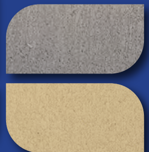
Charcoal (Above) & Appinstone (below).